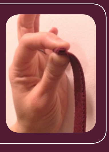
Tightly roll the fabric into a coil.

Take a strip of fabric and pinch the end.